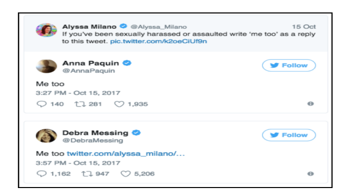
Fig. 1. The first tweet with regarding to the metoo challenge

sexually harassed or assaulted wrote 'Me too' as a status, we might give people a sense of the magnitude of the problem" Within hours, millions of women and men too disclosed their harassment story through twitter, Facebook and Instagram. People started talking about the abuse they have confronted in their lives.